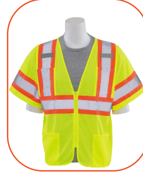
65 YEAR OLD TECHNOLOGY REFLECTIVE ONLY