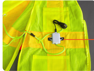
USB RECHARGEABLE BATTERY (1 OZ) INCLUDES TYPE-C CHARGING CORD