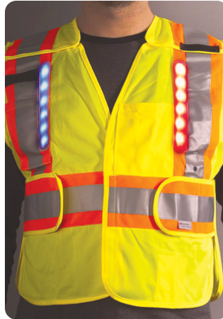
PUBLIC SAFETY L.E.D. VEST